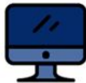
Websites & Ecommerce